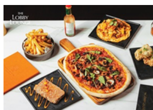
The Lobby Lounge