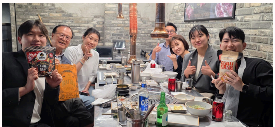
Dinner with the team at a barbecue restaurant