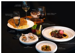
Beast and Butterflies