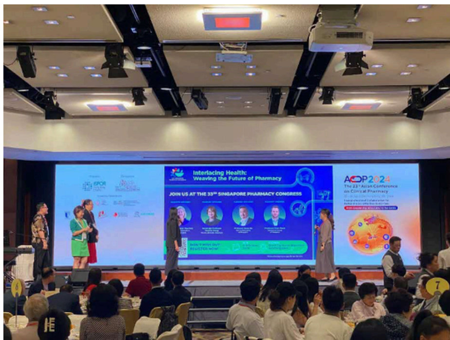
Our Singapore representatives doing a short skit on "Travel with Us!" with the intent of selling koyok about our coming Singapore Pharmacy Congress